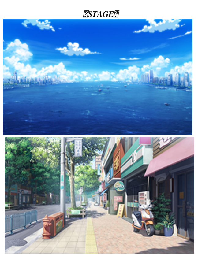
●Wuhan - the River City

The game carried the original, unprecedented system which basically uploads your every choice to our cloud sever, and shows the result to all after data was gathered and calculated on our page. So the ending isn't final yet, and the rest is for you to write.