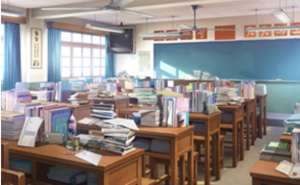
●Wuhan No.12 High School

Found in 1954, a prominent high school, and has a group of students studies Fine Art every grade.