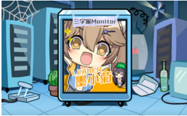
•Your decisions will guide the game to come!

The game carried the original, unprecedented system which basically uploads your every choice to our cloud sever, and shows the result to all after data was gathered and calculated on our page. So the ending isn't final yet, and the rest is for you to write.